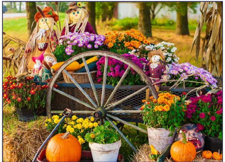
Exhibit Guest Pass

Exhibitor Trade Show: Thursday: 8:00am-6:00pm; Friday: 8:00am-1:30pm